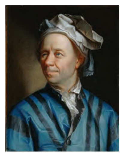
Euler

calculate in his head and, after his loss of vision, he used a scribe to record his discoveries. The puzzle he was considering was this: Imagine that there are 36 officers belonging to six different military regiments, each regiment having six officers of different ranks. How does one arrange them in the form of a square such that each row and column has six officers, and no rank or regiment appears more than once in a row or column?