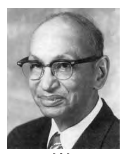
R.C. Bose

In fact, one can accommodate more variables by superposing additional orthogonal Latin squares. This is useful in the design of experiments wherever there are many variables involved, such as in medical research where one may need to test a medical treatment for its efficacy on patients of different age, weight, stages of a disease and so on, while needing to eliminate any effects due to such unavoidable variations. For a given order n , however, there can be a maximum of n - 1 mutually orthogonal Latin squares-"mutual" because any pair of them will be orthogonal. But it's not necessary that the entire set of n-1 mutually orthogonal Latin squares exist. If they do exist, they are said to form a complete set of mutually orthogonal Latin squares. Such a complete set can be constructed if n is a prime number—divisible only by one and itself, such as 3, 5, 7, 11 and so on-or a power of a prime number. In 1938, Bose showed [7] how to construct a complete set